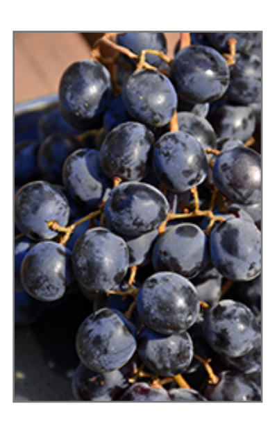
Glenora Grape fruit

Aside from its primary use as an edible, Glenora Grape is sutiable for the following landscape applications;