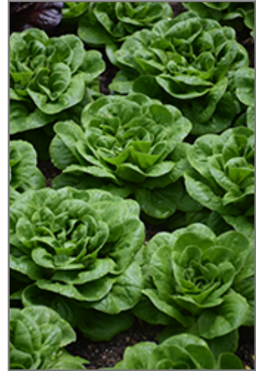
Buttercrunch Lettuce

Buttercrunch Lettuce will grow to be about 12 inches tall at maturity, with a spread of 6 inches. When planted in rows, individual plants should be spaced approximately 8 inches apart. This vegetable plant is an annual, which means that it will grow for one season in your garden and then die after producing a crop. Because of its relatively short time to maturity, it lends itself to a series of successive plantings each staggered by a week or two; this will prolong the effective harvest period.