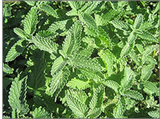
Walker's Low Catmint foliage

Walker's Low Catmint is a fine choice for the garden, but it is also a good selection for planting in outdoor pots and containers. It is often used as a 'filler' in the 'spiller-thriller-filler' container combination, providing a mass of flowers against which the thriller plants stand out. Note that when growing plants in outdoor containers and baskets, they may require more frequent waterings than they would in the yard or garden.