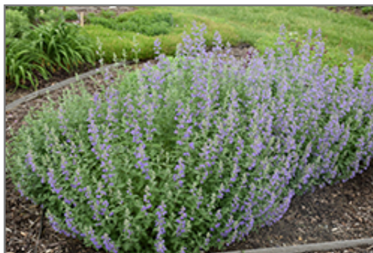
Walker's Low Catmint in bloom