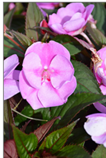
SunPatiens Vigorous Lavender Splash New Guinea Impatiens flowers