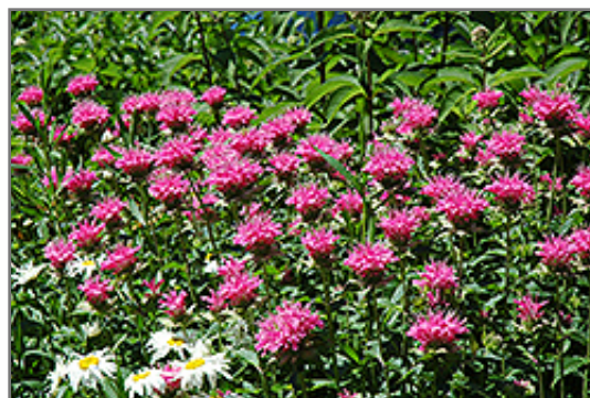
Marshall's Delight Beebalm flowers