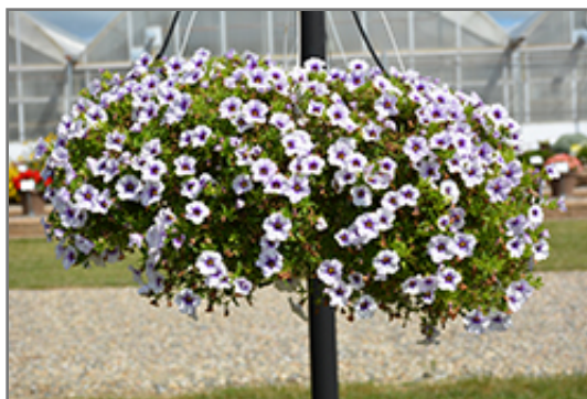
MiniFamous Neo Violet Ice Calibrachoa in bloom