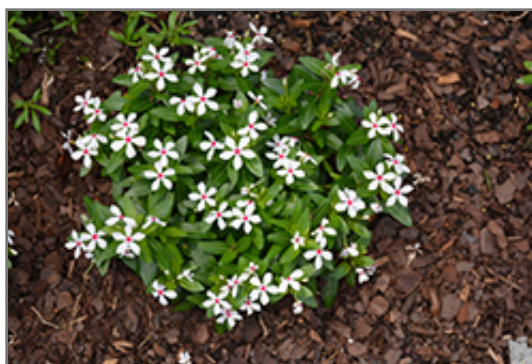
Soiree Kawaii White Peppermint Vinca in bloom