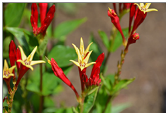
Little Redhead Indian Pink flowers