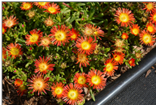
Delmara Red Ice Plant flowers

Delmara Red Ice Plant will grow to be only 4 inches tall at maturity extending to 6 inches tall with the flowers, with a spread of 15 inches. When grown in masses or used as a bedding plant, individual plants should be spaced approximately 12 inches apart. Its foliage tends to remain low and dense right to the ground. It grows at a fast rate, and under ideal conditions can be expected to live for approximately 5 years. As an evergreen perennial, this plant will typically keep its form and foliage year-round.