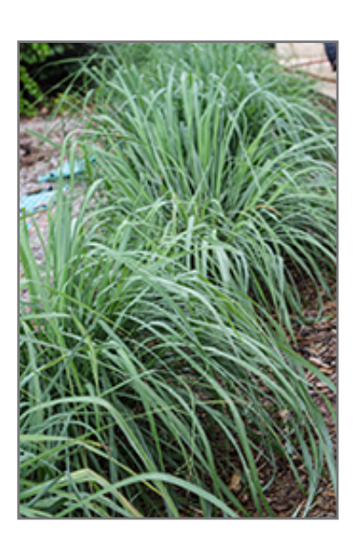
Lemon Grass

This plant is quite ornamental as well as edible, and is as much at home in a landscape or flower garden as it is in a designated herb garden. It should only be grown in full sunlight. It does best in average to evenly moist conditions, but will not tolerate standing water. It is not particular as to soil pH, but grows best in rich soils. It is highly tolerant of urban pollution and will even thrive in inner city environments. Consider applying a thick mulch around the root zone in winter to protect it in exposed locations or colder microclimates. This species is not originally from North America. It can be propagated by division.