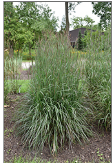
Blackhawks Bluestem in bloom