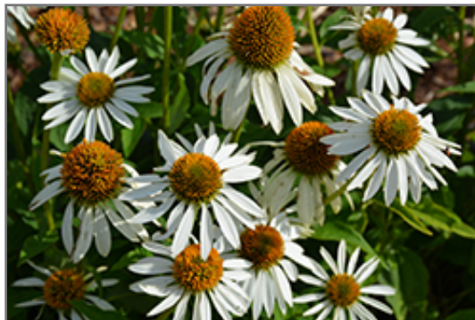
Happy Star Coneflower flowers

Happy Star Coneflower is recommended for the following landscape applications;