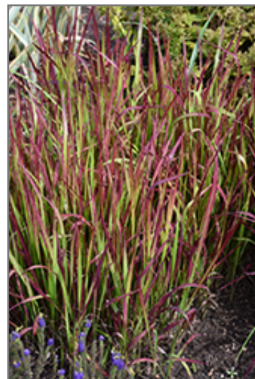
Red Baron Japanese Blood Grass foliage

Red Baron Japanese Blood Grass is recommended for the following landscape applications;