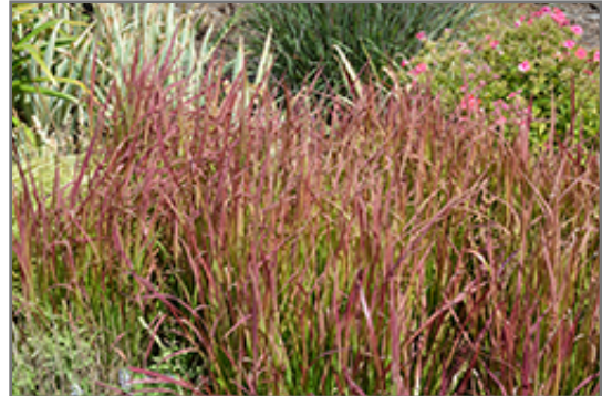
Red Baron Japanese Blood Grass

Red Baron Japanese Blood Grass will grow to be about 20 inches tall at maturity, with a spread of 18 inches. It grows at a slow rate, and under ideal conditions can be expected to live for approximately 20 years. As an herbaceous perennial, this plant will usually die back to the crown each winter, and will regrow from the base each spring. Be careful not to disturb the crown in late winter when it may not be readily seen!