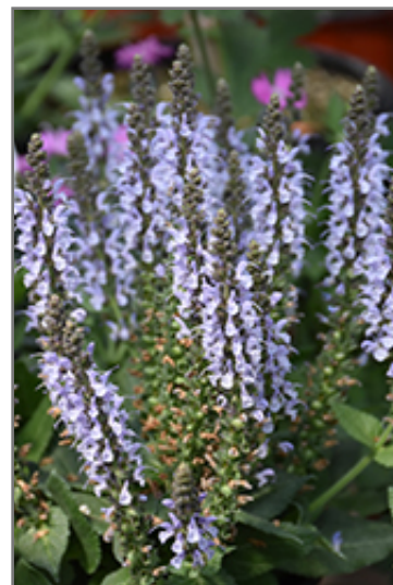
Bumblesky Meadow Sage flowers

Bumblesky Meadow Sage is recommended for the following landscape applications;