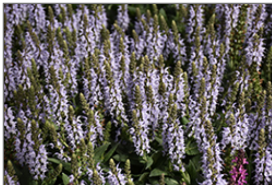
Bumblesky Meadow Sage flowers