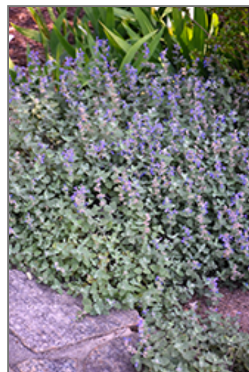
Early Bird Catmint in bloom