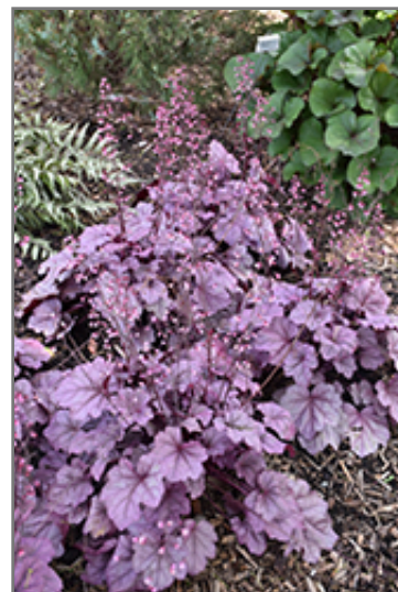
Pink Panther Coral Bells in bloom