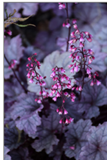
Pink Panther Coral Bells flowers

Pink Panther Coral Bells is a fine choice for the garden, but it is also a good selection for planting in outdoor pots and containers. With its upright habit of growth, it is best suited for use as a 'thriller' in the 'spiller-thriller-filler' container combination; plant it near the center of the pot, surrounded by smaller plants and those that spill over the edges. Note that when growing plants in outdoor containers and baskets, they may require more frequent waterings than they would in the yard or garden.