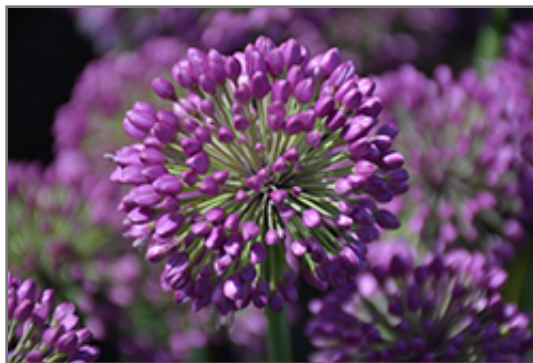
Lavender Bubbles Ornamental Onion flowers