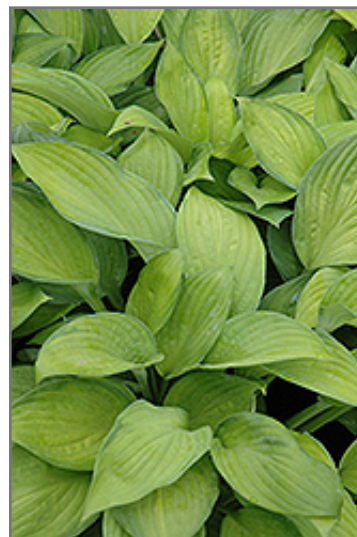
Gold Standard Hosta foliage