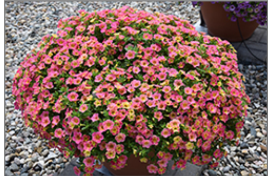
Chameleon Sunshine Berry Calibrachoa in bloom

Chameleon Sunshine Berry Calibrachoa is a fine choice for the garden, but it is also a good selection for planting in outdoor containers and hanging baskets. Because of its trailing habit of growth, it is ideally suited for use as a 'spiller' in the 'spiller-thriller-filler' container combination; plant it near the edges where it can spill gracefully over the pot. Note that when growing plants in outdoor containers and baskets, they may require more frequent waterings than they would in the yard or garden.