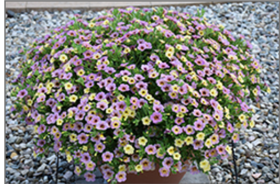
Chameleon Blueberry Scone Calibrachoa in bloom