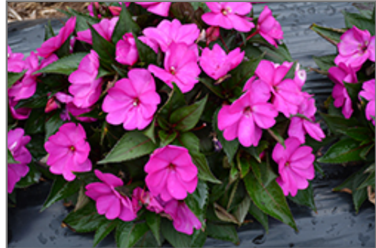
SunPatiens Compact Purple New Guinea Impatiens in bloom

SunPatiens Compact Purple New Guinea Impatiens will grow to be about 24 inches tall at maturity, with a spread of 24 inches. When grown in masses or used as a bedding plant, individual plants should be spaced approximately 20 inches apart. Its foliage tends to remain dense right to the ground, not requiring facer plants in front. This fast-growing annual will normally live for one full growing season, needing replacement the following year.