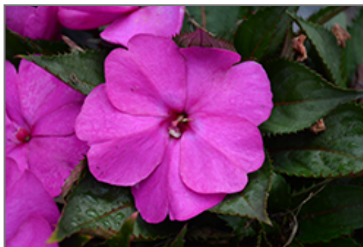
SunPatiens Compact Purple New Guinea Impatiens flowers

SunPatiens Compact Purple New Guinea Impatiens is recommended for the following landscape applications;