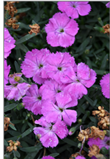
Paint The Town Fuchsia Pinks flowers

Paint The Town Fuchsia Pinks is recommended for the following landscape applications;