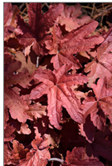
Fun and Games Red Rover Foamy Bells foliage

Fun and Games Red Rover Foamy Bells is recommended for the following landscape applications;