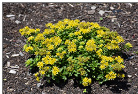
Little Miss Sunshine Stonecrop in bloom