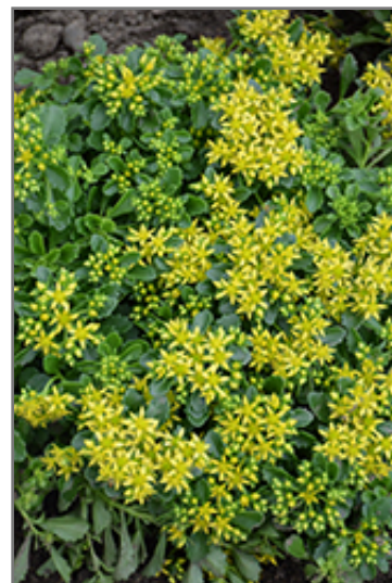
Little Miss Sunshine Stonecrop flowers

Little Miss Sunshine Stonecrop is recommended for the following landscape applications;