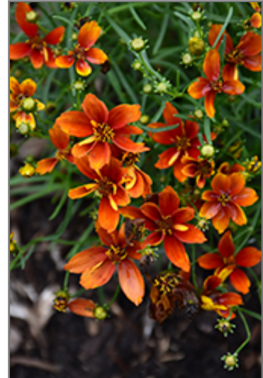
Sizzle And Spice Crazy Cayenne Tickseed flowers

Sizzle And Spice Crazy Cayenne Tickseed is recommended for the following landscape applications;