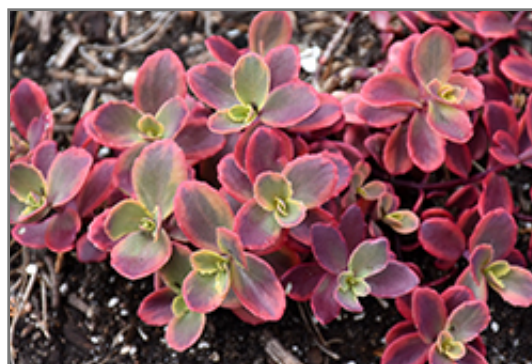
Sunsparkler Wildfire Stonecrop foliage