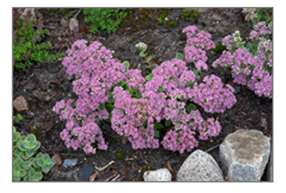
Lime Twister Stonecrop in bloom