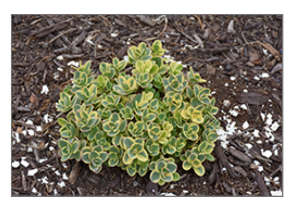
Lime Twister Stonecrop

Lime Twister Stonecrop will grow to be only 4 inches tall at maturity extending to 6 inches tall with the flowers, with a spread of 18 inches. When grown in masses or used as a bedding plant, individual plants should be spaced approximately 15 inches apart. Its foliage tends to remain low and dense right to the ground. It grows at a fast rate, and under ideal conditions can be expected to live for approximately 15 years. As an herbaceous perennial, this plant will usually die back to the crown each winter, and will regrow from the base each spring. Be careful not to disturb the crown in late winter when it may not be readily seen!