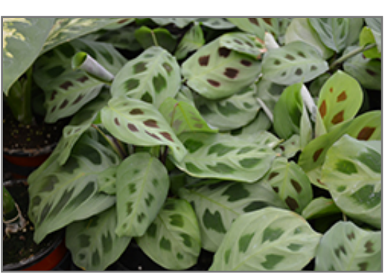
Prayer Plant foliage