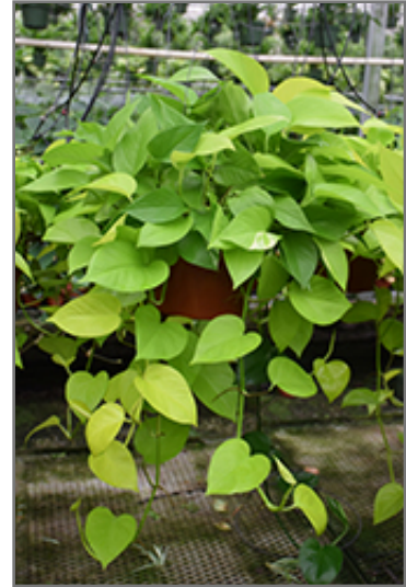
Neon Pothos in full

When grown indoors, Neon Pothos can be expected to grow to be about 5 feet tall at maturity, with a spread of 24 inches. It grows at a fast rate, and under ideal conditions can be expected to live for approximately 10 years. This houseplant performs well in both bright or indirect sunlight and strong artificial light, and can therefore be situated in almost any well-lit room or location. It does best in average to evenly moist soil, but will not tolerate standing water. The surface of the soil shouldn't be allowed to dry out completely, and so you should expect to water this plant once and possibly even twice each week. Be aware that your particular watering schedule may vary depending on its location in the room, the pot size, plant size and other conditions; if in doubt, ask one of our experts in the store for advice. It is not particular as to soil type or pH; an average potting soil should work just fine. Be warned that parts of this plant are known to be toxic to humans and animals, so special care should be exercised if growing it around children and pets.