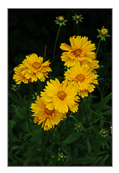
Early Sunrise Tickseed flowers