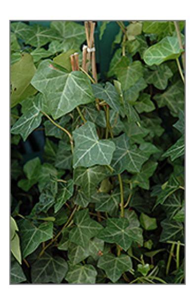
Thorndale Ivy foliage

There are many factors that will affect the ultimate height, spread and overall performance of a plant when grown indoors; among them, the size of the pot it's growing in, the amount of light it receives, watering frequency, the pruning regimen and repotting schedule. Use the information described here as a guideline only; individual performance can and will vary. Please contact the store to speak with one of our experts if you are interested in further details concerning recommendations on pot size, watering, pruning, repotting, etc.