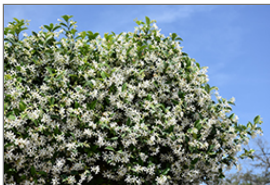
Madison Star-Jasmine flowers