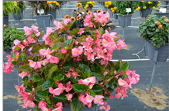
Big Pink Green Leaf Begonia in bloom

Big Pink Green Leaf Begonia is a fine choice for the garden, but it is also a good selection for planting in outdoor containers and hanging baskets. It is often used as a 'filler' in the 'spiller-thriller-filler' container combination, providing a mass of flowers and foliage against which the larger thriller plants stand out. Note that when growing plants in outdoor containers and baskets, they may require more frequent waterings than they would in the yard or garden.