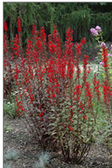
Black Truffle Cardinal Flower in bloom