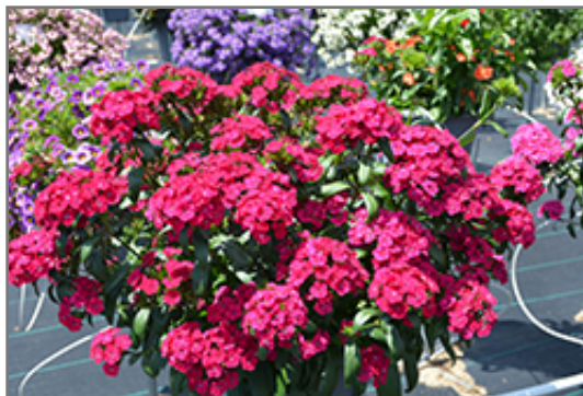
Jolt Cherry Hybrid Pinks in bloom