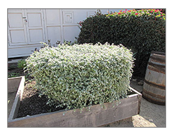
Licorice Plant