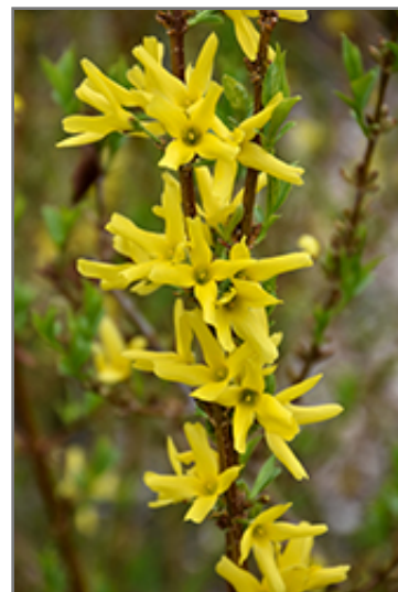
Bronx Forsythia flowers