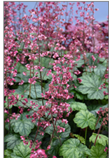
Berry Timeless Coral Bells flowers