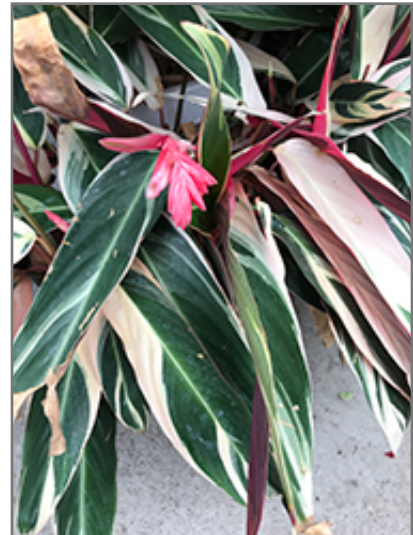
Tricolor Stromanthe flowers

This plant does best in full sun to partial shade. It prefers to grow in average to moist conditions, and shouldn't be allowed to dry out. It is not particular as to soil pH, but grows best in rich soils. It is somewhat tolerant of urban pollution. This is a selected variety of a species not originally from North America. It can be propagated by division; however, as a cultivated variety, be aware that it may be subject to certain restrictions or prohibitions on propagation.