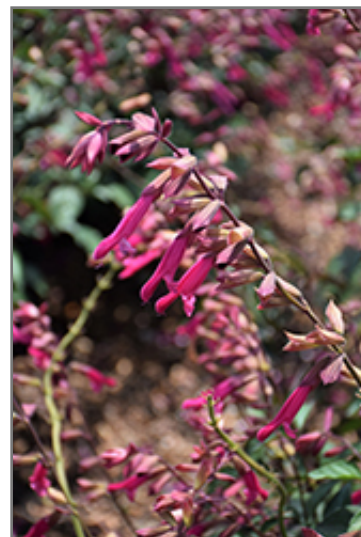
Wendy's Wish Sage flowers