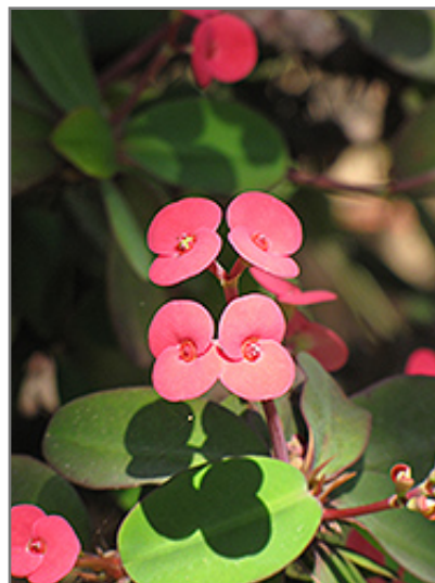
Crown Of Thorns flowers