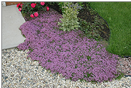
Red Creeping Thyme in bloom