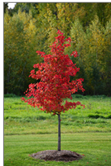
Wildfire Black Gum in fall