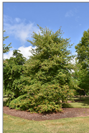
Wildfire Black Gum