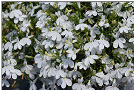
Techno Upright White Lobelia flowers

Techno Upright White Lobelia is recommended for the following landscape applications;