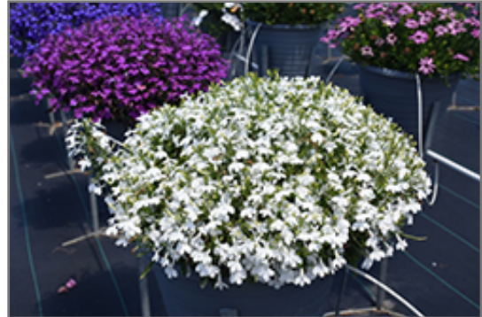
Techno Upright White Lobelia in bloom

Techno Upright White Lobelia is a fine choice for the garden, but it is also a good selection for planting in hanging baskets. Because of its trailing habit of growth, it is ideally suited for use as a 'spiller' in the 'spiller-thriller-filler' container combination; plant it near the edges where it can spill gracefully over the pot. Note that when growing plants in outdoor containers and baskets, they may require more frequent waterings than they would in the yard or garden.