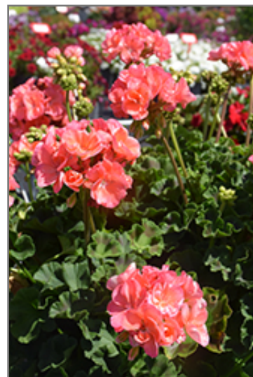
Dynamo Salmon Geranium flowers