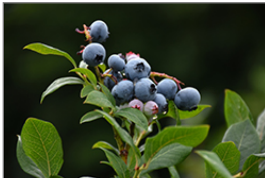
Northland Blueberry fruit

Northland Blueberry is a multi-stemmed deciduous shrub with an upright spreading habit of growth. Its average texture blends into the landscape, but can be balanced by one or two finer or coarser trees or shrubs for an effective composition.