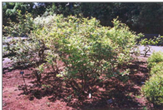
Northland Blueberry