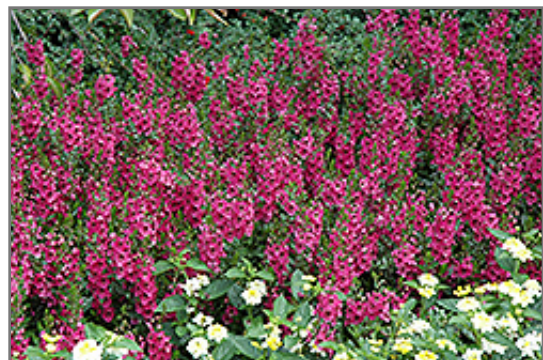
Archangel Dark Rose Angelonia in bloom