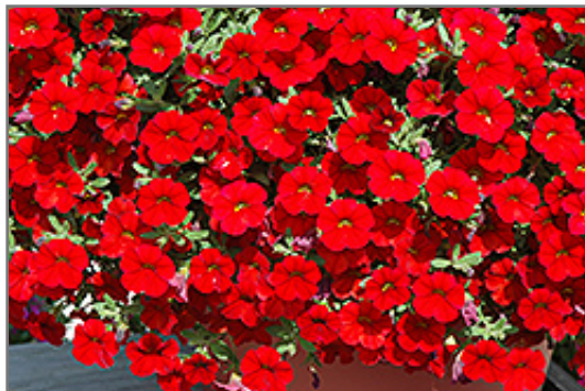
Cabaret Bright Red Calibrachoa flowers

Cabaret Bright Red Calibrachoa is recommended for the following landscape applications;