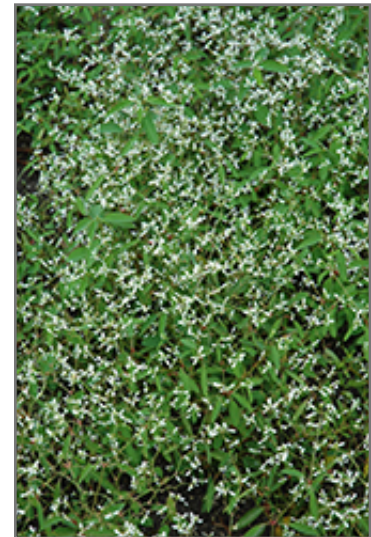
Breathless White Euphorbia flowers