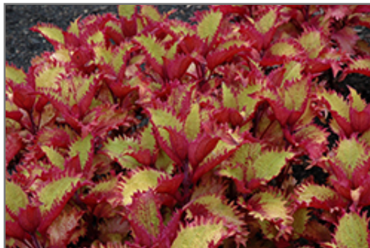
Henna Coleus foliage